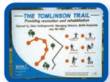
FT915- 01 - Pair of Round Wooden Support Posts for Trail Data Boards