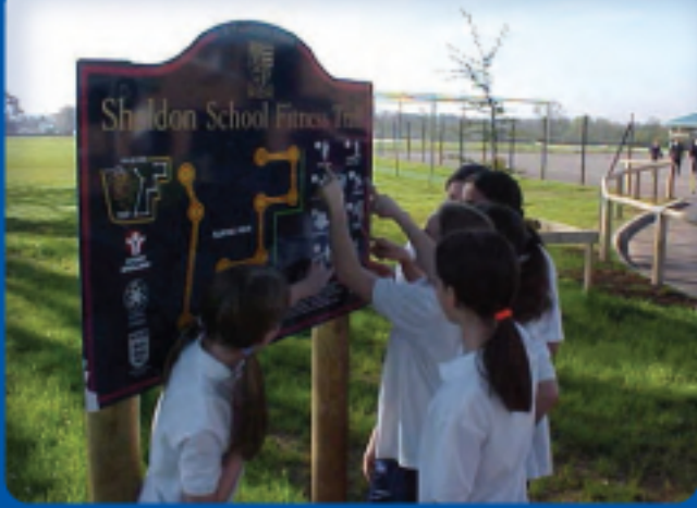
FT915 - Trail Data Boards Designed and made to order