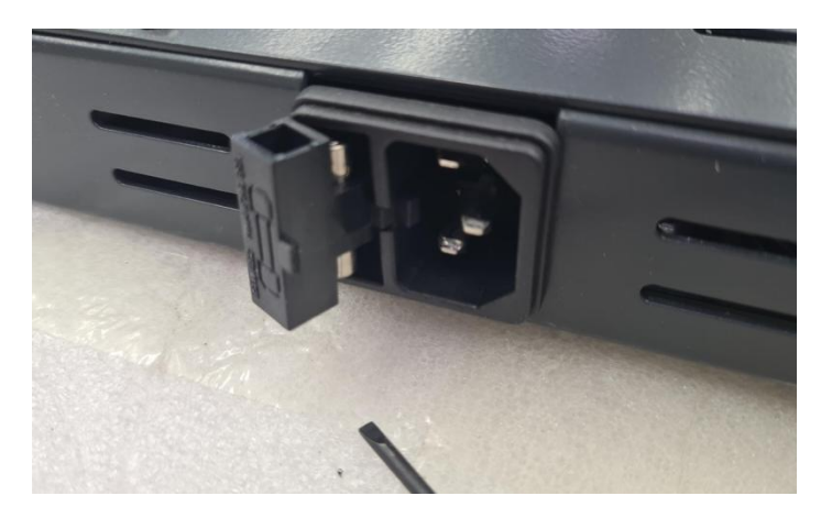
Lift fuse cover from socket and remove

Remove fuse and re-install correct fuse: