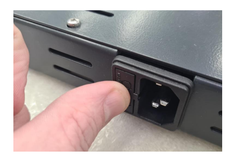
Place fuse and holder back into socket and push holder until it is level with the rear of the socket to ensure correct fitment