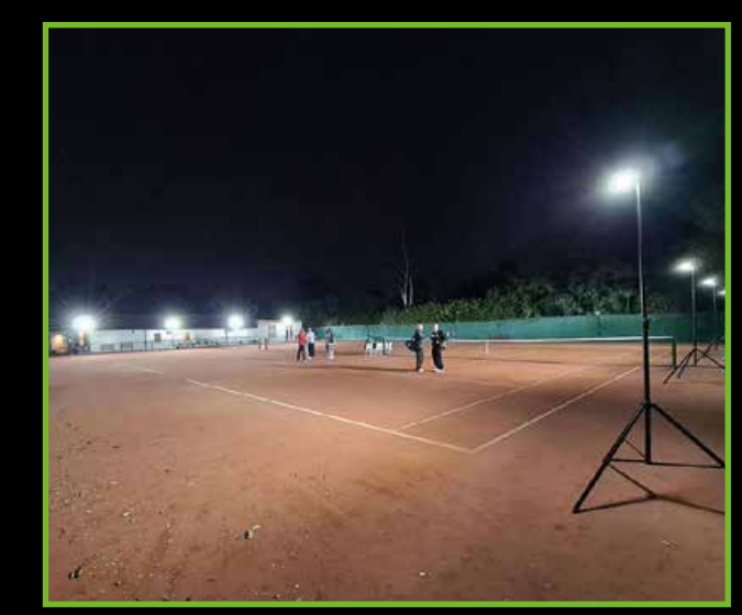
8 kit Adult training on twin court or pro training on single court