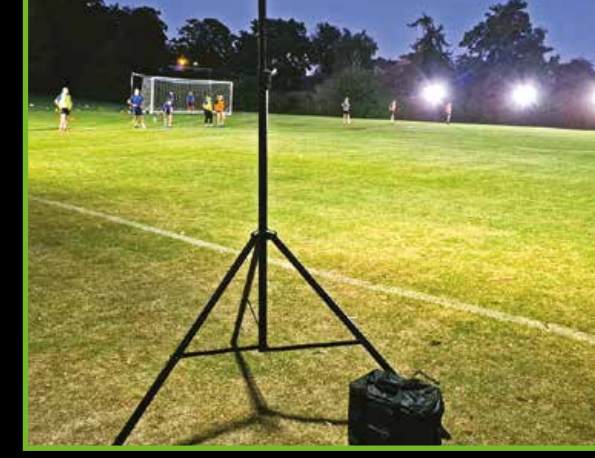
6 kit 1/3 full pitch