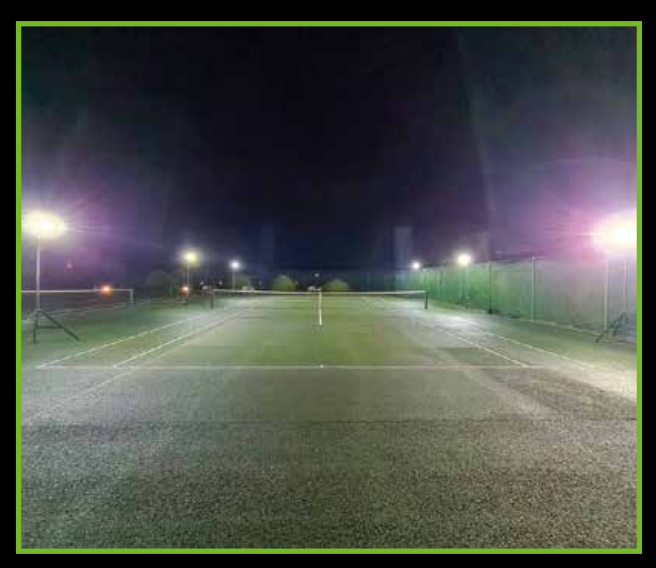
6 kit Junior training on twin court or adult training on single court