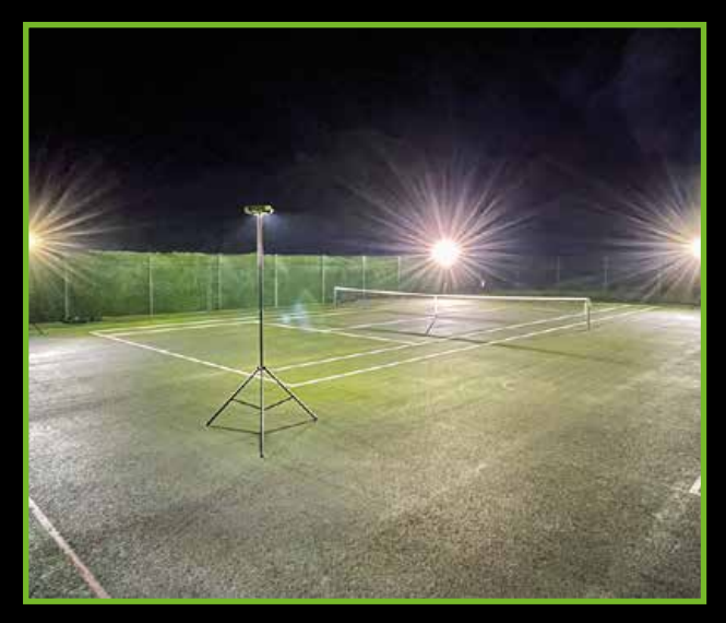
4 kit Junior training on single court